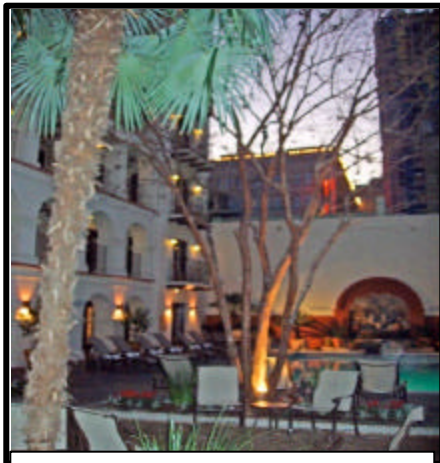
Poolside at San Antonio's Omni La Mansion.