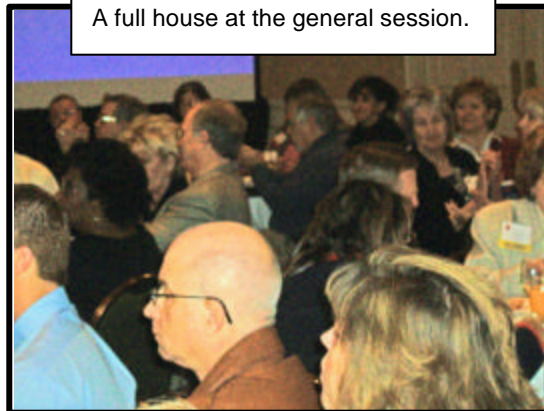
A full house at the general session.