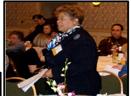
A member poses a question during the membership meeting.